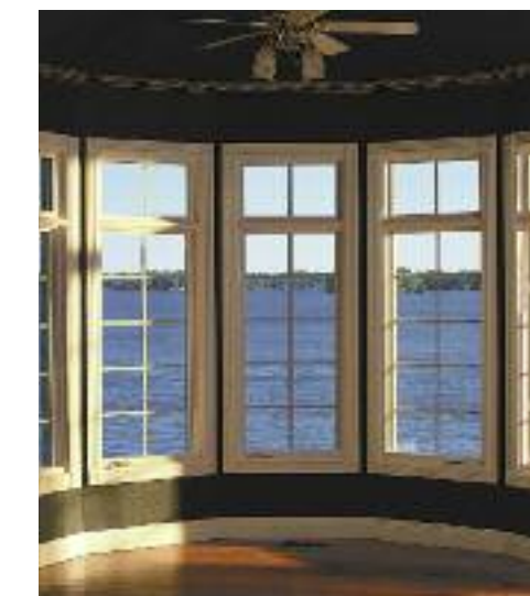
A beautiful complement to any room, casement windows feature an easy-touch crank to open and close the window. Sash opens to a 90° angle for convenient cleaning from inside the home.

Casement and awning windows round out the new construction window offering from Alside. Combine casement or awning windows with a variety of window styles and configurations to create larger window systems that offer ample glass exposure and ventilation.