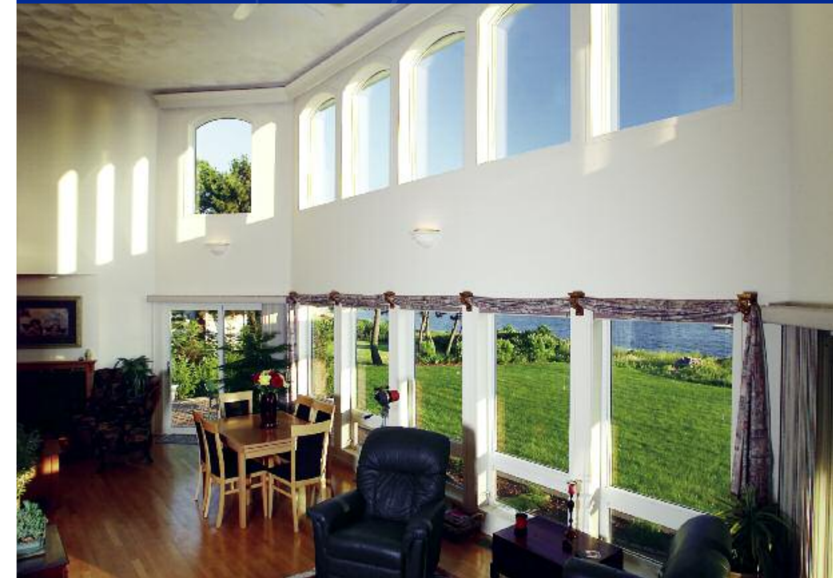
Residential and light commercial installations.

Alside Alside PO Box 2010 Akron, Ohio 44309 1-800-922-6009 www.alside.com