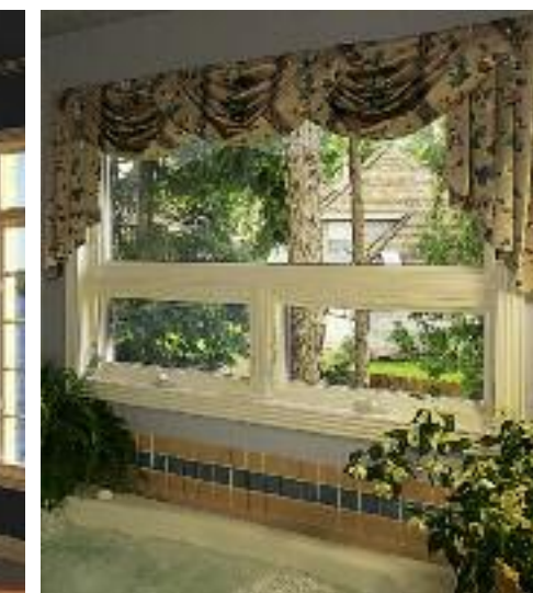
Awning windows are an ideal way to add ventilation to any area. Combine awning windows with fixed-lites for a custom look that's functional yet elegant.