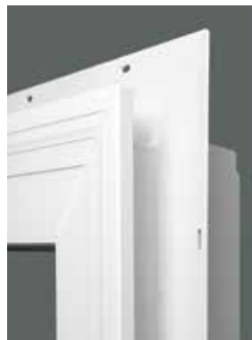
1900 Series Single-Hung with Nailing Fin and Integral Brickmould J-Channel