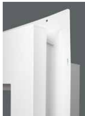
1900 Series Double-Hung with Nailing Fin (shown with optional 3.5" flat casing)