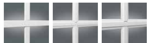
5/8" Flat 3/4" Contoured 1" Contoured