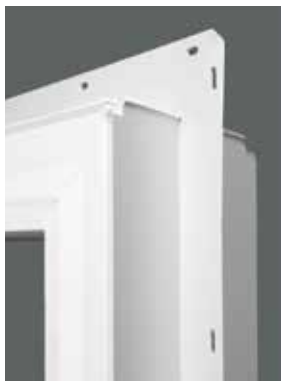
1700 Series Single-Hung with Nailing Fin

Multiple framing options streamline installation for every type of construction, cladding, and masonry type with dependable jobsite delivery options to improve the contractor and builder experience with today's design trends in mind.