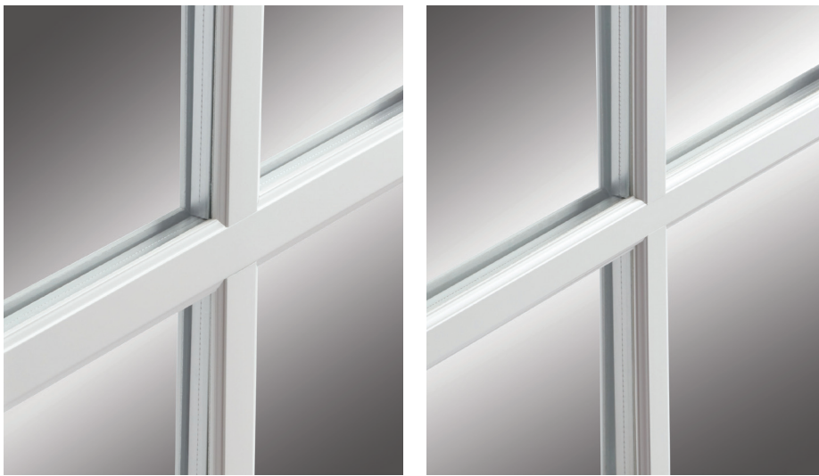
1-1/4" (above left) and 7/8" (above right) Simulated Divided Lite with mill finish shadow bar.

Simulated Divided Lite Windows deliver refined design through straight symmetrical borders that mimic traditional true divided lites. Recreating this handcrafted aesthetic—created through small, individual panes of glass separated by muntins and mounted in a frame—our Simulated Divided Lites provide the perfect measure of style and dimension for enhanced beauty.